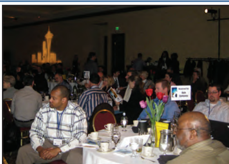
Guests watch the Excellence in Construction Awards in progress.