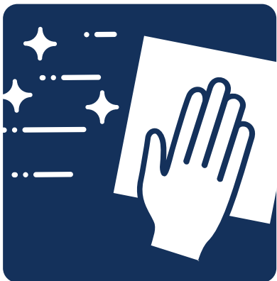
DISINFECT ALL SURFACES