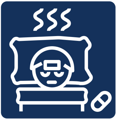
STAY HOME IF YOU'RE SICK