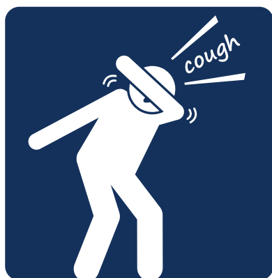
COVER COUGHS & SNEEZES