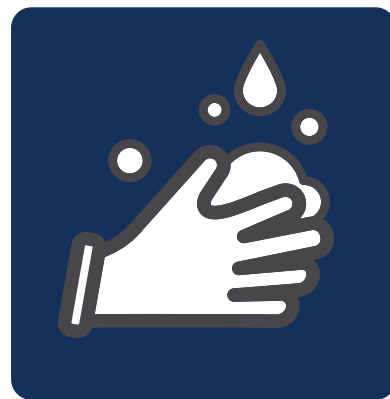
WASH HANDS FREQUENTLY