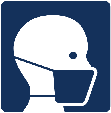
WEAR THE REQUIRED PPE