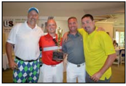
HUB International's foursome took First in ABC's Golf Extravaganza.