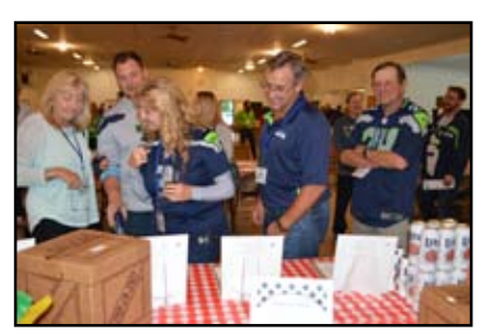
ABC's Crab Feed & Silent Auction was held in October at Vasa Park in Bellevue.