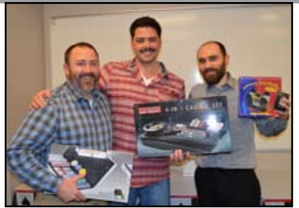
The top three winners in ABC's Texas Hold'em Tournament.