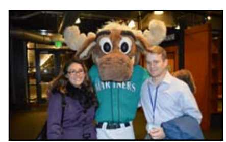
Guests had their photos taken with the Moose at A Night Out at the Ball Park at Safeco Field in November.