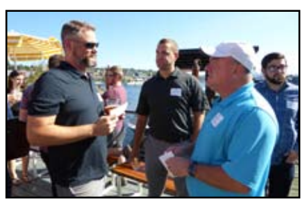
Guests played Bingo to facilitate networking at the Beers with Peers event.