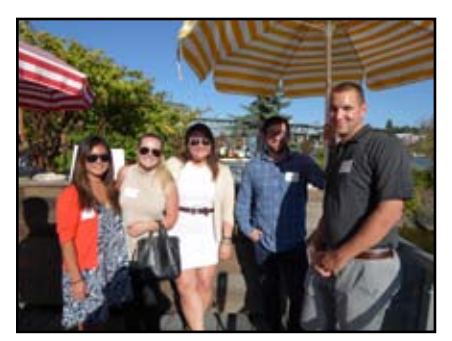
LDG's Beers with Peers at Westward in Seattle on a hot summer August day.