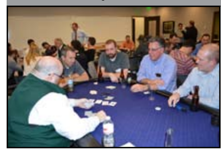
The annual Texas Hold'em Tournament at ABC's office in January.