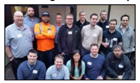
The 2015-16 class of the Rising Star Program at their graduation event at Local Burger in May.

We launched the Rising Star Program in 2015, and it is still going strong with another sold out class of 20 participants. This six month-long educational track of leadership and management education seminars is geared towards preparing people for the next step in their career, as well as providing improved leadership within the ABC membership. The program includes team-building, networking, enrollment in Toastmasters and the ABC National Young Professional Peer Group, and provides mentor connections. 2017 will bring the launch of the next step in leadership skill-building that will offer continued education for the Rising Stars.