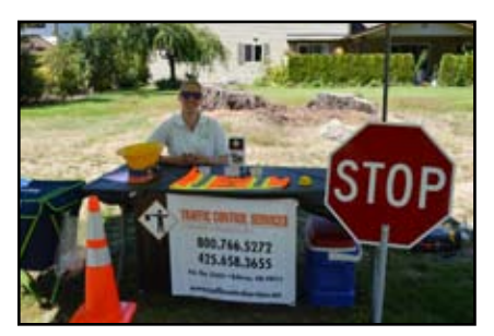
Traffic Control Services' tee at ABC's Golf Extravaganza at Oakbrook in July.