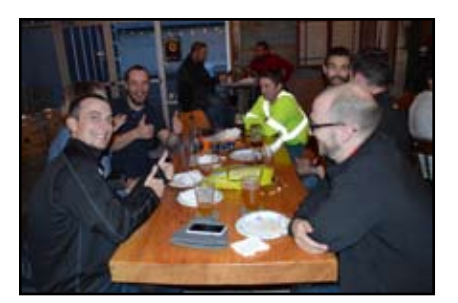
The 2016-17 Rising Stars at their "Mid-Point Mixer" at Seapine Brewing Company in SoDo in November.