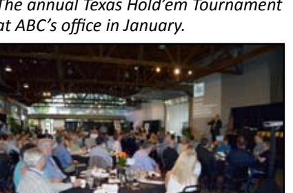
The 2016 Excellence in Construction & Safety Awards Showcase in May.