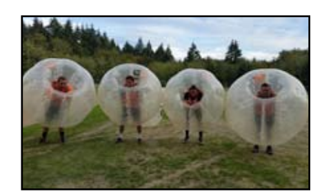
LDG's hilarious Bubble Ball Soccer event at Wilburton Hill Park in September.