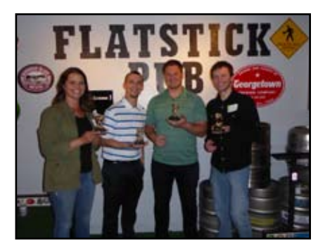
The winning foursome at LDG's Drinks on the Links at Flatstick Pub in April.